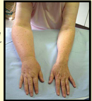
Figure 1. Swollen arm as a result of lymphoedema after breast cancer treatment

Reflexology is a physical therapy focusing on the feet. Practitioners use specific pressure with thumb, finger and hand techniques to stimulate these reflexes on the premise that this effects a physical change in the body. Anecdotally, cancer patients suffering from lymphoedema have reported positive effects on the swollen arm after reflexology treatment.